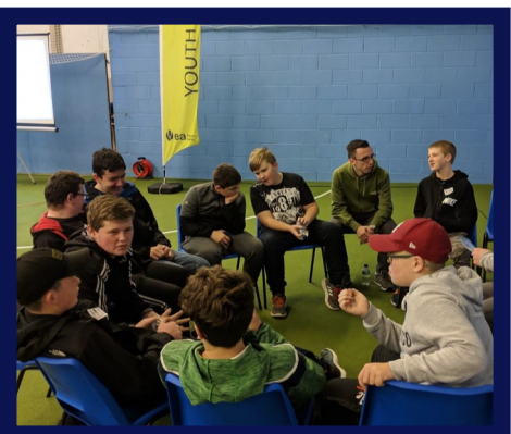
Young people taking part in an EA programme

Our experience shows that young people who have shown limited or no ambition, either educationally or through limited opportunities for employment, and who have experienced significant poverty, may turn to crime. There is potential within the Action Plan and via the additional resources, to address these issues to help ensure young people get a better start in life.