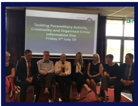
Speakers taking part in a panel discussion

“It is of the utmost importance that we continue to work together to keep people safe.”