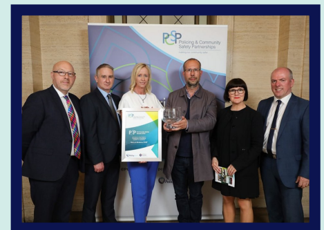
Derry and Strabane PCSP at the event

ceived against 7 different award categories, which included an Award for Contribution to Embedding a Culture of Lawfulness. This award recognised innovative projects/initiatives that have contributed to embedding a culture of lawfulness or improving confidence in the rule of law through challenging the coercive control of paramilitaries or organised crime gangs and criminals. Derry & Strabane PCSP won this award for their work with local theatre The Playhouse to produce the